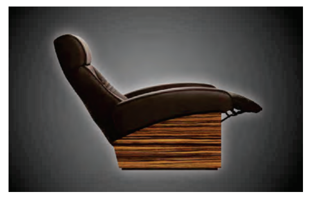
unique aesthetic design

Design is not just a fashion instrument for CINEAK, but a corporate philosophy and a management tool. All of our award-winning designs are innovative, timeless and distinctly different than others.